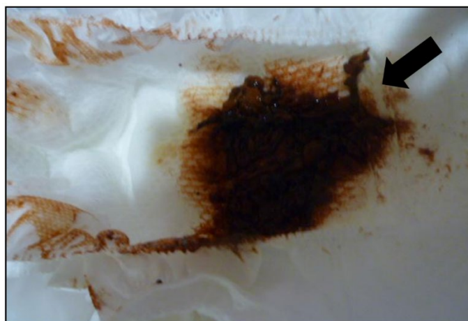
Patient 2 (day 7)

Supplementary Figure S3 Abdominal ultrasonography showing the dilated bile duct (arrow) of patient 1, in which there was no color signal. In normal newborns, the bile duct is undetectable by ultrasonography