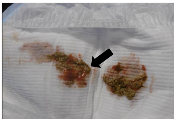
Patient 1 (day 8)