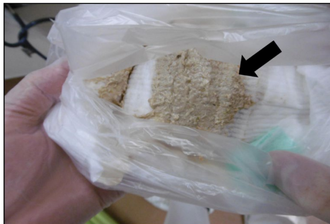
Patient 1 (day 7)