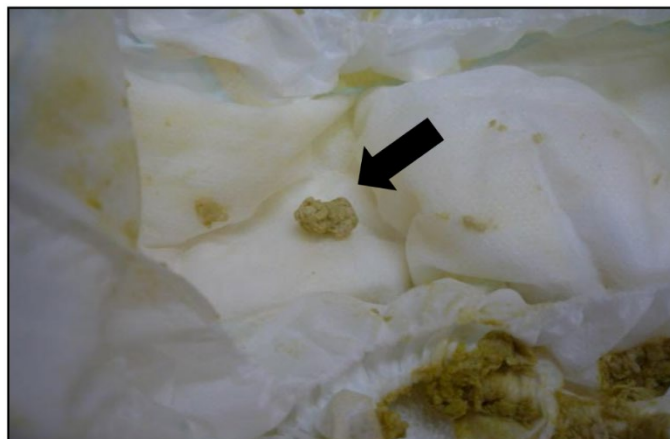
Patient 2 (day 23)

Supplementary Figure S5 Acholic stool (arrow) of patient 2 at day 23