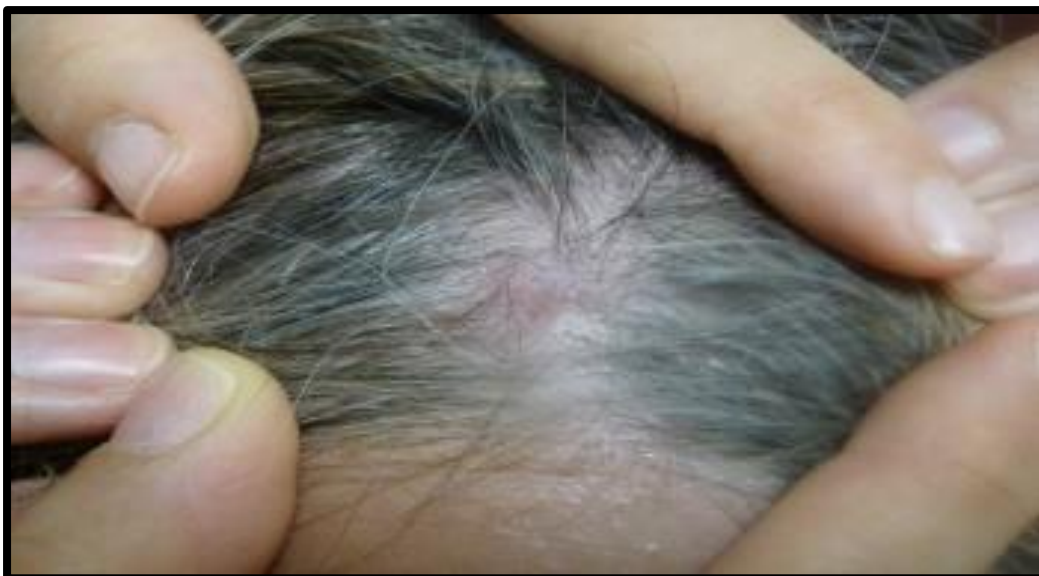
Supplementary figure 1: scalp lesions.