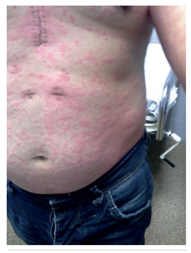
Figure. Urticaria lesions 2 weeks after valve implantation.

Treatment with anti-IgE was rejected by the patient, who requested that the implant be removed. One year after the onset of symptoms, the ring was removed. During the early postoperative period, he experienced an exacerbation of urticaria that required temporary intensification of therapy with antihistamines and corticosteroids. Since then (24 months), he has remained asymptomatic without medication.