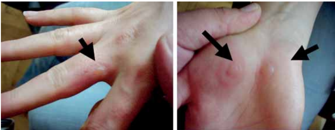
Figure 2. Bullous lesions on the palm and interphalangeal parts of hand.