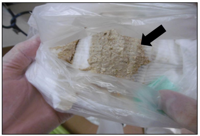
Patient 1 (day 7)

Supplementary Figure S1 Acholic stool (arrow) of patient 1 at day 7