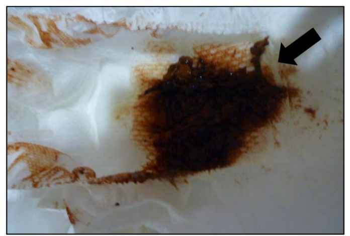
Patient 2 (day 7)

Supplementary Figure S3 Abdominal ultrasonography showing the dilated bile duct (arrow) of patient 1, in which there was no color signal. In normal newborns, the bile duct is undetectable by ultrasonography