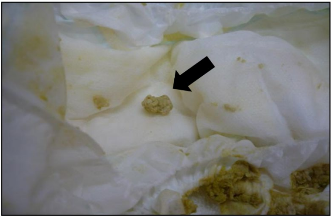
Patient 2 (day 23)

Supplementary Figure S5 Acholic stool (arrow) of patient 2 at day 23