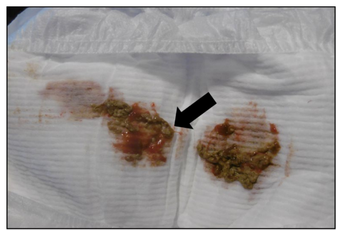
Patient 1 (day 8)

Supplementary Figure S1 Acholic stool (arrow) of patient 1 at day 7