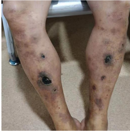
Supplementary Figure 1. Some irregular scabby lesions irregular scabby lesions